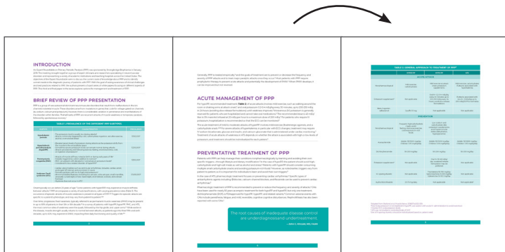
Inside spread pages 2, 4 and 5